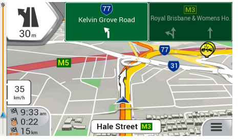
Real Signpost Rendering

Real Signpost Rendering, Enhanced Junction View and Tunnel Mode help show you what to look for and where to go, so you can easily navigate through areas and intersections you're unfamiliar with.