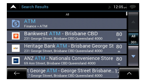
"Points of Interest" (POI)

Real Signpost Rendering, Enhanced Junction View and Tunnel Mode help make travelling a breeze! They show you what to look for and where to go, so you can easily navigate through areas and intersections you're unfamiliar with.