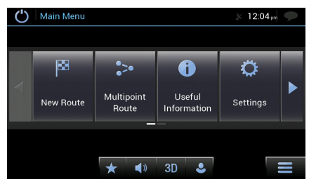
Customised User Interface

The software package in this Navigation system is called NextGen and it's known to be intuitive and extremely easy to use. The user interface is clear, easy to read and the menus are simple to navigate.