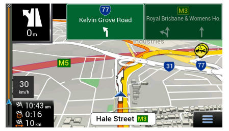
Real Signpost Rendering

The software package in this Navigation system is called NextGen and it's known to be intuitive and extremely easy to use. The user interface is clear, easy to read and the menus are simple to navigate.